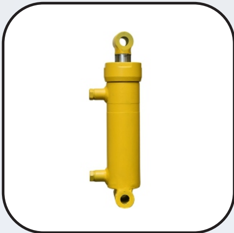
Heavy Duty Two Way Hydraulic Cylinder