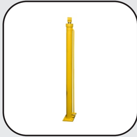
MS Hydraulic Lift Cylinder