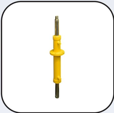
Two Way Hydraulic Cylinder