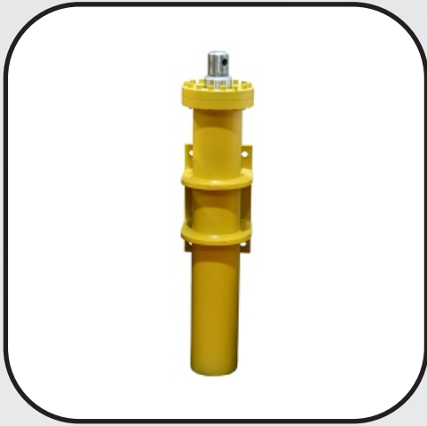
Hydraulic Leveling Cylinder