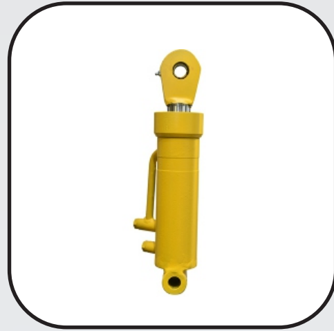
Brake Outer Hydraulic Cylinder