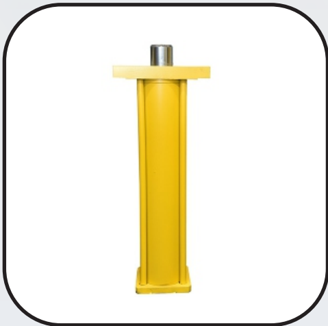
Hydraulic Cylinder For Molding Machine