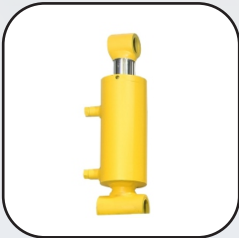
Double Acting Hydraulic Cylinder