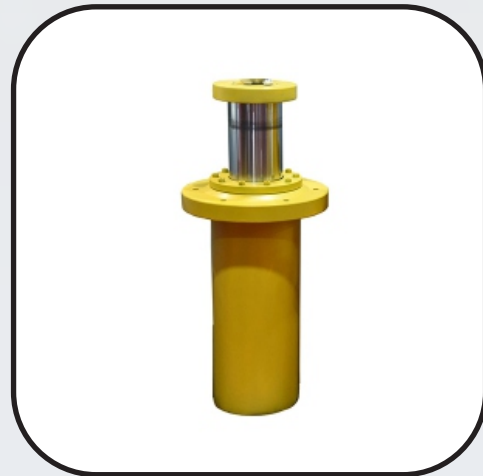
Heavy Duty Press Hydraulic Cylinder