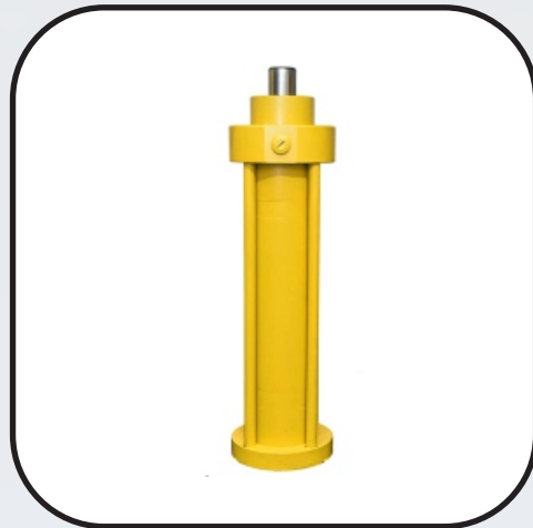
Special Purpose Hydraulic Cylinder