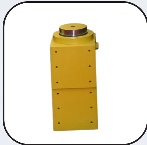
High Precision Hydraulic Cylinder